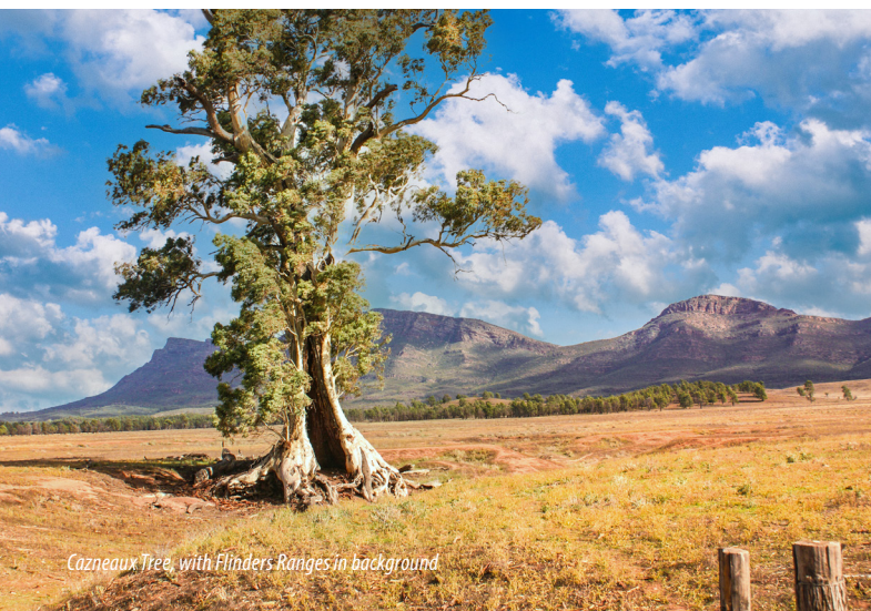
Cazneau Tree, with Flinders Ranges in background.

Morning: Visit Burke's Grave and the beautiful Cullyamurra Waterhole, both a few kilometres east of our hotel. The scenery along Cooper Creek, in the vicinity of Innamincka, is stunning. Beautiful water holes, fabulous gum trees, and lots of colourful Australian birds. Then visit the famous Dig Tree, where on April 22, 1861 Burke, Wills and King probably realised they were doomed. Afternoon: You will have some free time. You may like to visit the former Australian Inland Mission Hospital building, now a National Parks office and museum, located right next