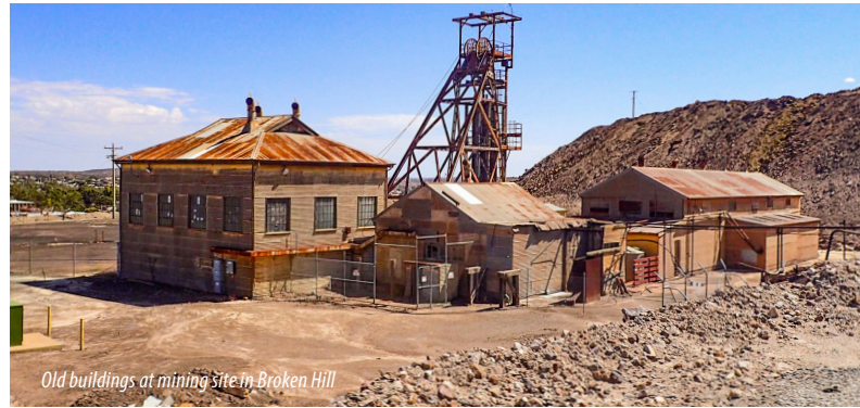
Old buildings at mining site in Broken Hill