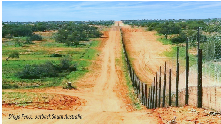
Dingo Fence, outback South Australia